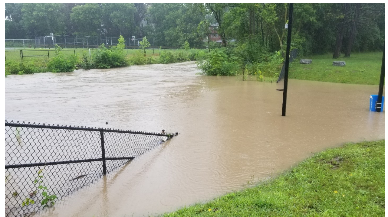
Figure 2 – Flooding along Onondaga Creek at Kirk Park – August 2021.